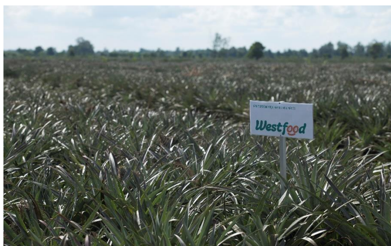
Westfood pineapple raw material areas

In 2017 Westfood achieved gross profit of VND65.3 billion, rose by VND18.1 billion, equivalent to an increase of 90% compared to 2016; after-taxed profit reached VND17.49 billion, rose by VND 8.47 billion, an increase of 94% compared to that of 2016. Facing the fierce competition from new enterprises, in order to achieve this result, Westfood has selected products that have the advantage of prestige and quality to provide the market, at the same time focusing on the key market – Japan, the country that requires the strictest quality standards in the world. It is the reason why they have been sold at the good price. In addition, the company also has a long-term plan to actively reserve raw materials for production and business activities in the off-season-months. Besides, Westfood effectively manages input materials through the search and construction of reputable suppliers, ensuring 100% for stable quality of inputs, meeting high standards of export to up markets with the most competitive price on the market, especially take the initiative in own raw material sources.