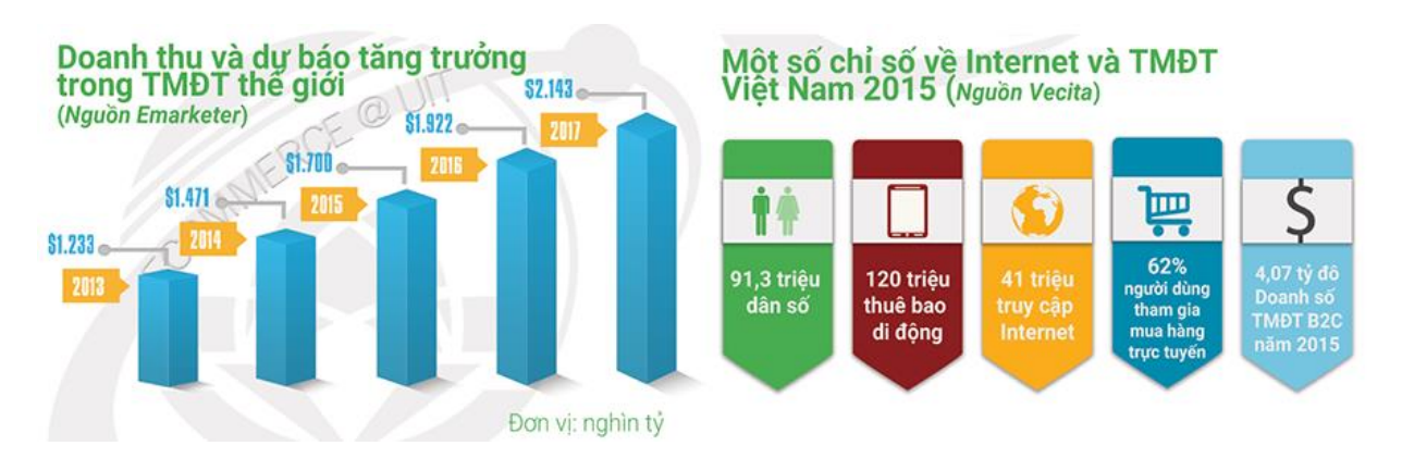
Increasement chart of ecommerce in Vietnam and in the world

In Vietnam, according to results of a survey conducted in 2015 by E-commerce and IT Agency, the purchase value of an online shopper in the year was estimated at 160 USD, B2C e-commerce sales reached about 4.07 billion USD.