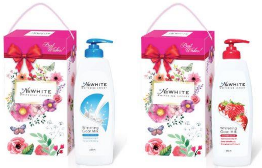
Gift box: NuWHITE Goat Milk & Nuwhite Whitening Goat Milk

vision of FIT Consumer in particular as well as the member companies of the FIT. Group in general with the mission to bring Vietnamese consumers high quality products, contributing to raise the Vietnamese brand in the international market.