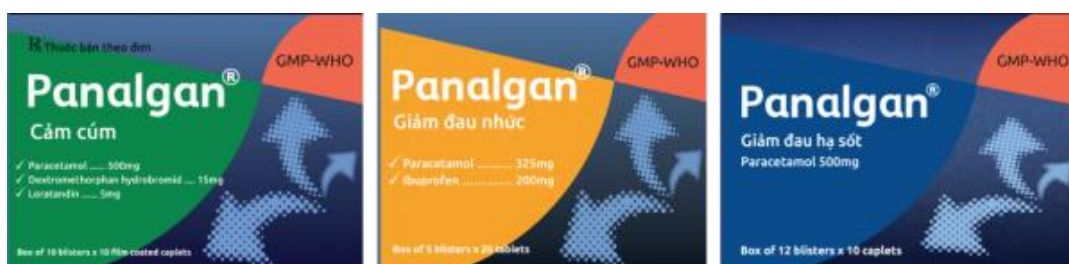
Some products of Panalgan line

Today, Panalgan is one of DCL's core products. The DCL Panalgan series are manufactured on modern lines imported from Canada and Korea, the quality of materials in accordance with United States Pharmacopoeia (USP), having analgesic, antipyretic, and pain-relief effect, which is very quick and effective. With new, more modern, user-friendly packaging, Panalgan is expected to have a breakthrough, becoming a line of drug which is always preferred and trusted. It can confirm that the Panalgan product lines in particular and other lines of DCL products are generally proud to be Vietnamese quality products, helping improve the health of the Vietnamese.