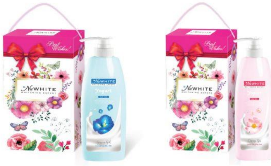
Gift box: NuWHITE Yogurt Milk

For a long time, NuWHITE shower cream line of FIT Cosmetics has received good feedback from the market, being one of the key product lines of FIT Cosmetics. The NuWHITE shower cream lines are made on a modern line, and based on a careful study of the needs of consumers of shower cream so the whitening, moisturizing effects and the aroma still dominates over the products in the same segment in the market.